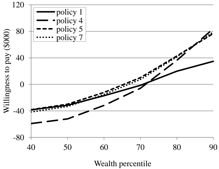
Figure 1A. Willingness to Pay for Private Long-Term Care Insurance – Single Male