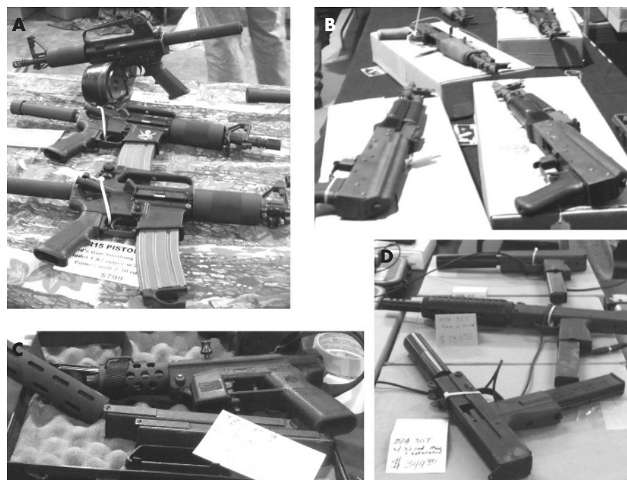
Figure 3 Examples of assault-type handguns. (A) AR15-type pistols. The gun in the rear is equipped with a 100-round magazine. (B) AK47-type pistols. (C) A TEC9 pistol. (D) MAC-type pistols.

in other states (23.4% and 4.1%, respectively, p < 0.0001 ) but not in California (11.1% and 7.1%, respectively, p = 0.61 ).