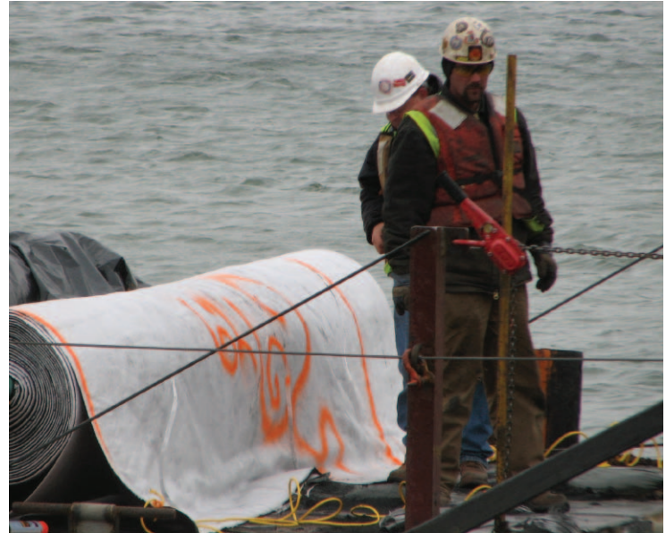
Stryker Bay remediation made formerly toxic site safe for boating and fishing.

One boat slip was separated from the bay with a rock dike, and transformed into a contained aquatic disposal facility where contaminated sediment can be safely stored.