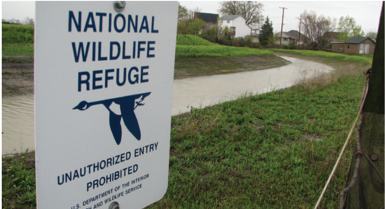
Agricultural fields transformed into natural wetland between Detroit and Toledo.

“When you then appeared on [the television show] ‘Dirty Jobs,’ you became a real celebrity and taking care of our snakes suddenly became an island mission,” mused the resident. “It seemed to me that everyone young and old alike began to think it was cool that we had the snakes and that we were trying to protect them.”