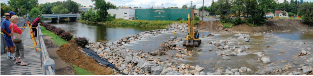
Construction on Chesaning weirs

improvements in the health of the Lakes, challenges remain and new ones continue to arise.