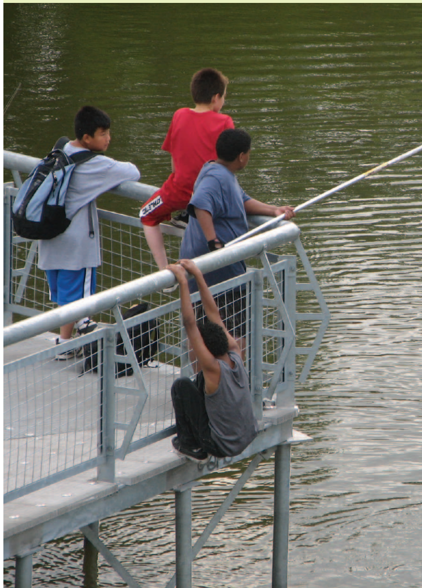
Stearns Park in Chicago, Illinois