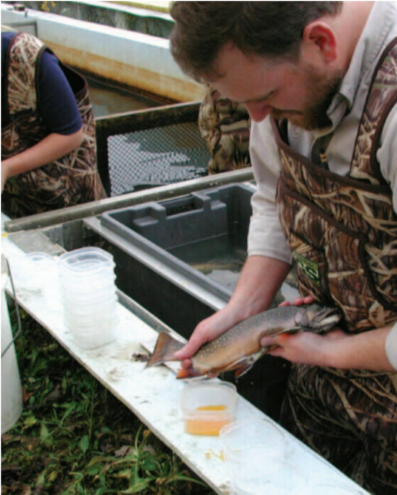
Spawning coaster brook trout

"It's clear to me the people in Collingwood have tremendous civic pride, and were highly motivated to be off the (Area of Concern) list first," Krantzberg says. "They're committed to not going backwards. They are proud to be a four seasons destination location, with beautiful water and wonderful recreational opportunities. And they are definitely going to maintain it."