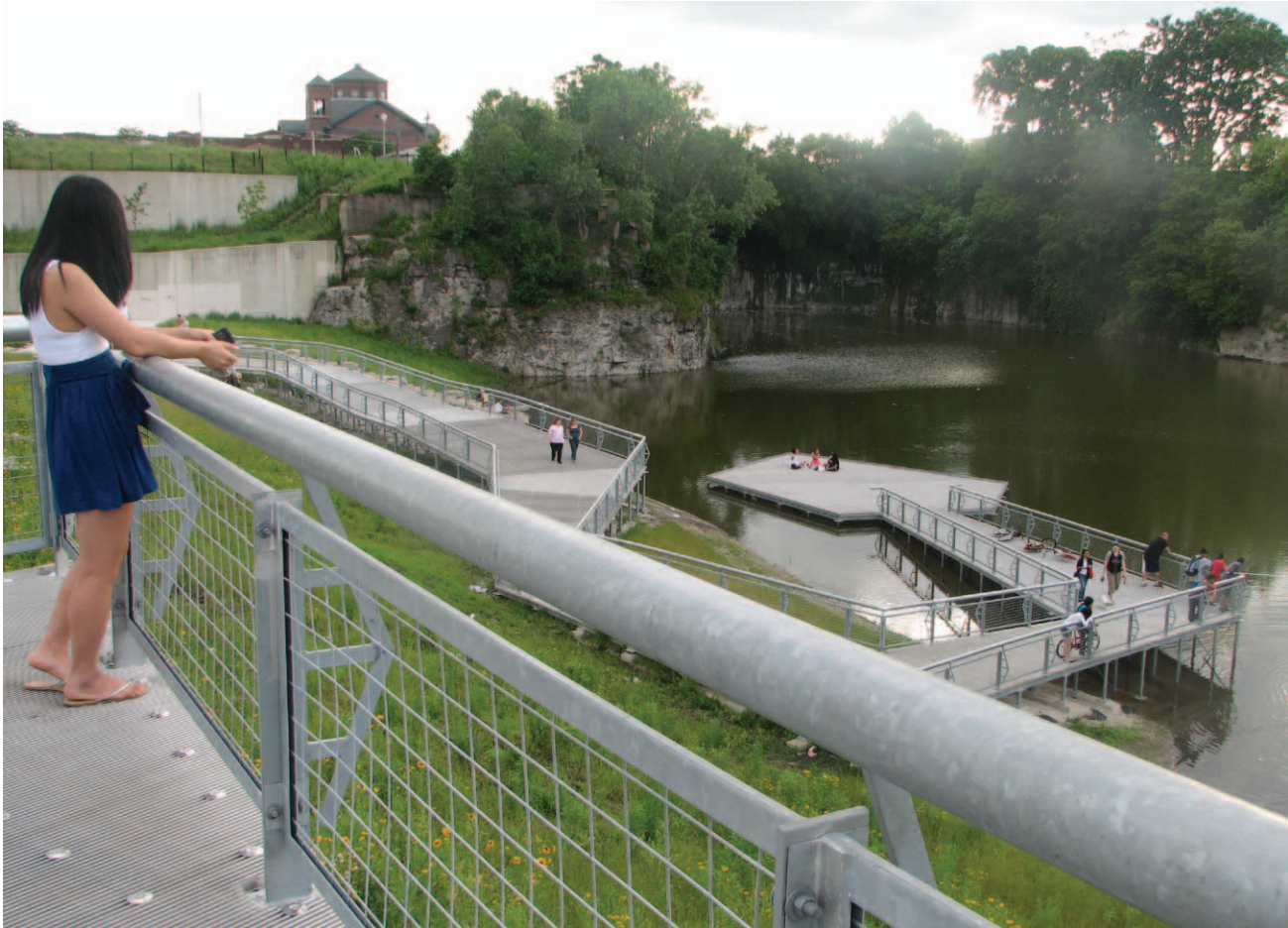
A limestone quarry and landfill for incinerator ash and construction waste is now billed as Chicago's most unusual park.

About 40,000 cubic feet of topsoil was used to cap the landfill. Recycled plastic and wood were used to construct board walks and a storm water recycling system treats water before funneling it into the quarry pond. An underground pump removes leachate from the incinerator ash.