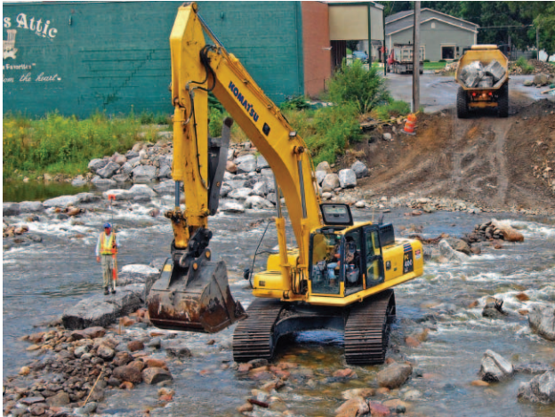
Construction of Chesaning weirs