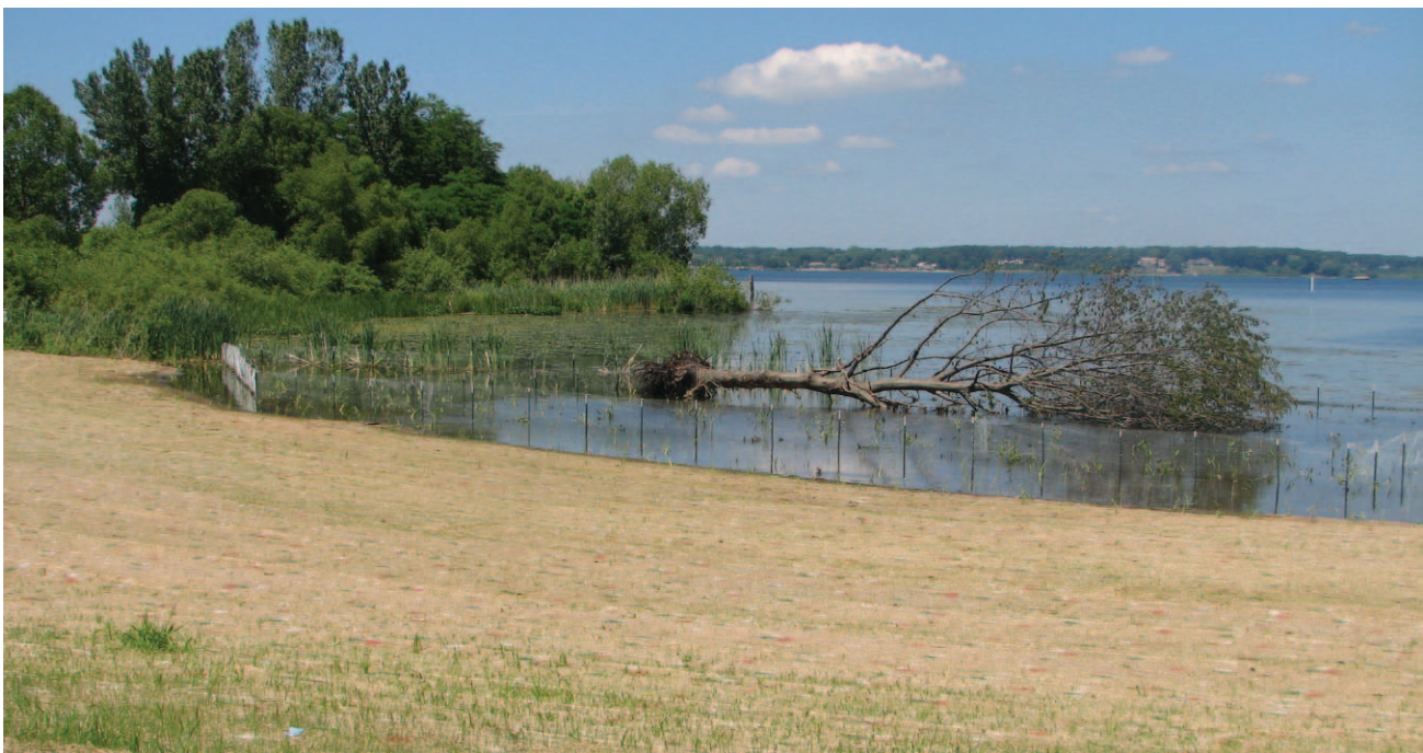
Felled trees create new habitat at Muskegon Lake.