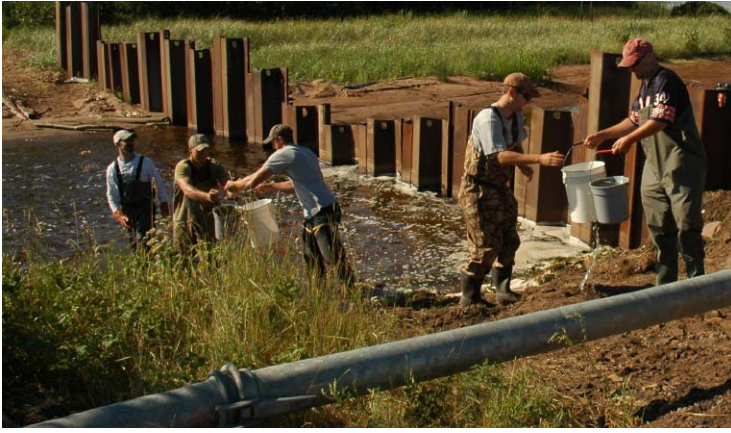
Wisconsin DNR staff assist in a fish rescue during the remediation of Hog Island Inlet.