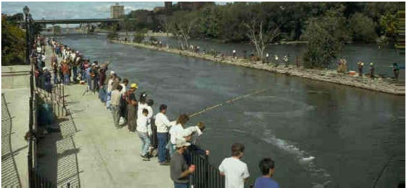
Early fall fishing on Oswego River, Oswego, New York

Today, civic leaders call it their “crown jewel.”