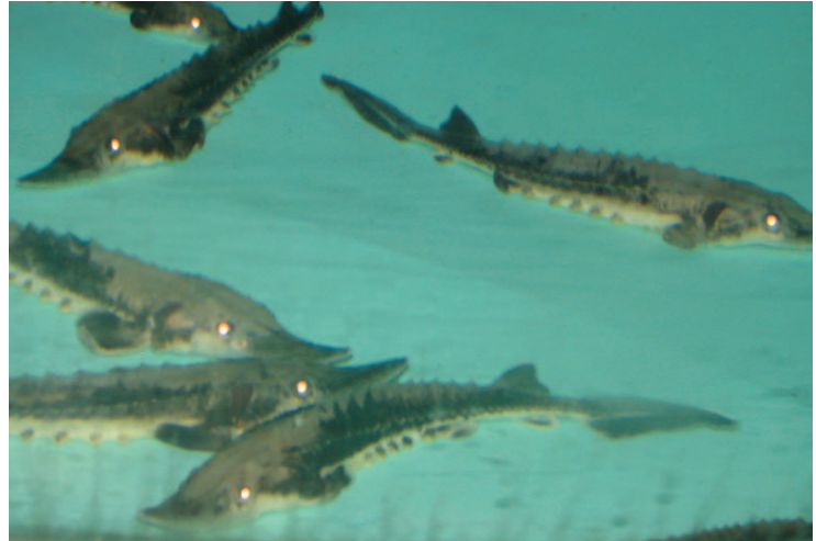
Year-old sturgeon from artificial spawning reefs in the Detroit River. The fish are raised by researchers until old enough to be released back into the river.

Over the past few decades Manny has seen the river go from “chocolate brown or a greenish yucky color... to what is in many areas clean blue water coming down from Lake Huron.”