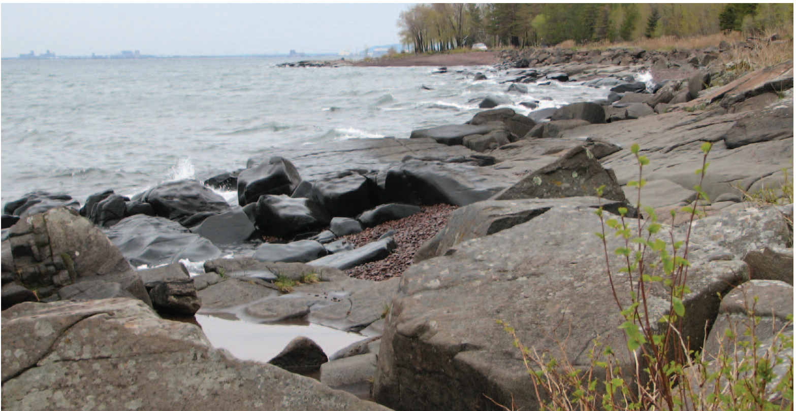
Lake Superior shoreline in Duluth

The Healing Our Waters-Great Lakes Coalition's No. 1 goal is to make sure that Great Lakes restoration succeeds. This report underscores that we have solutions to restore the Great Lakes, safeguard public health, create jobs and protect our way of life. It's time to use them so that we can protect this great resource now and for generations to come.