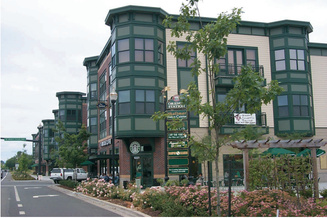
Portland's Orenco Station development is as accessible by car as by train.

The best example of the strength of this approach is at the suburban 190-acre Orenco Station on the Westside light rail line. The development, which was recognized by the National Association of Homebuilders as the best master planned community in the country, includes offices and retail with housing on the floors