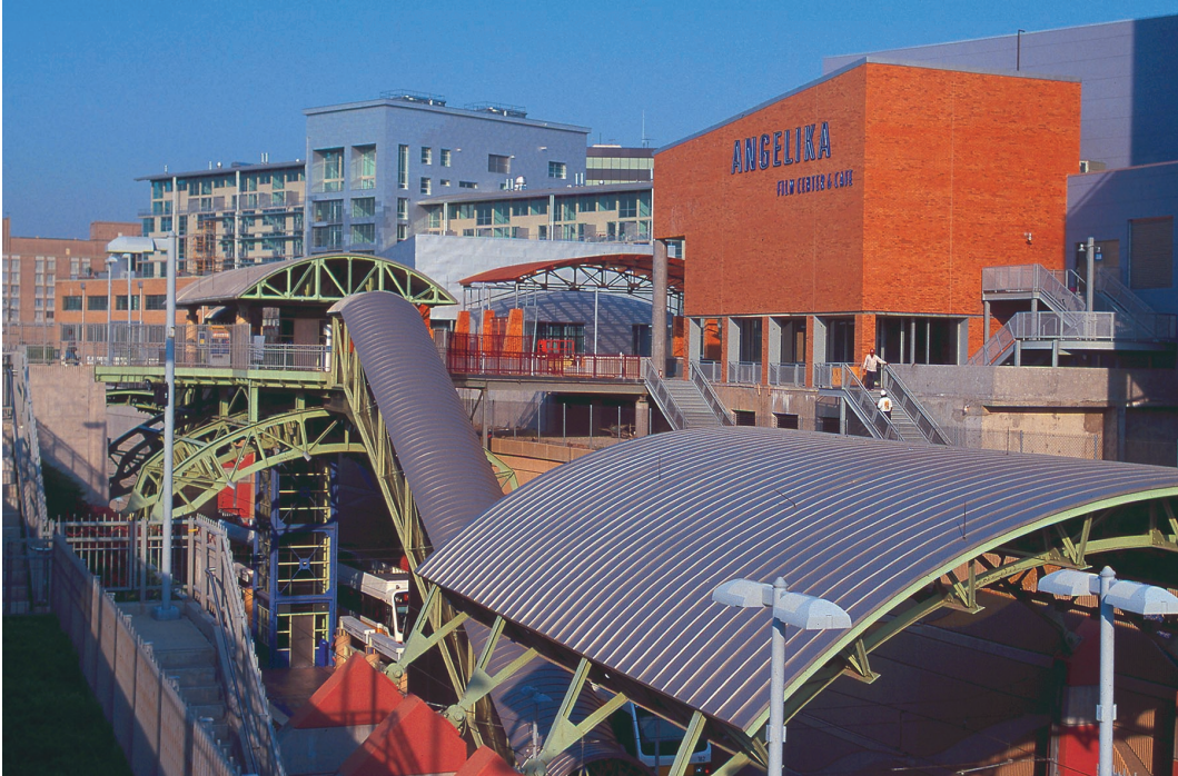
Advance planning and creative design allowed the developer to include shops and apartments above Mockingbird Station in Dallas, Texas.

above in the town center area. 42 Slightly further from the station, housing options are more varied and range from single-family homes to townhouses to lofts. In total, Orenco Station contains over 1,800 residential units, which have been sell-