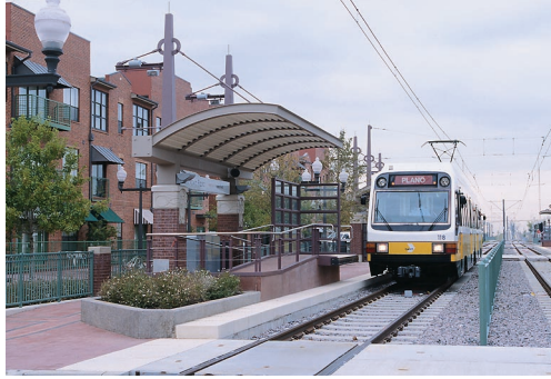
Planners in Plano located multi-use buildings rather than parking lots next to the rail station.