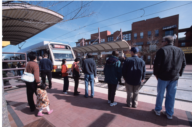
The light rail carries people from Dallas to Plano attractions.

Plano also adopted specific policies to promote redevelopment in the transit-