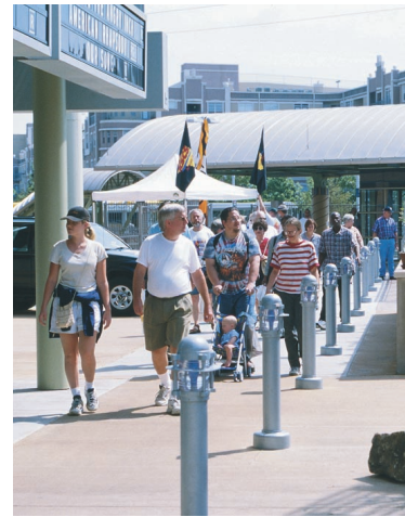
Walkability is a key characteristic of TOD projects.

improve air quality. A short drive to a rail stop can still produce significant pollution because catalytic converters that trap air pollution from cars do not work well when the vehicle is cold. 19 Thus, a development pattern that allows a few more people to walk to the train station can produce emissions reductions.