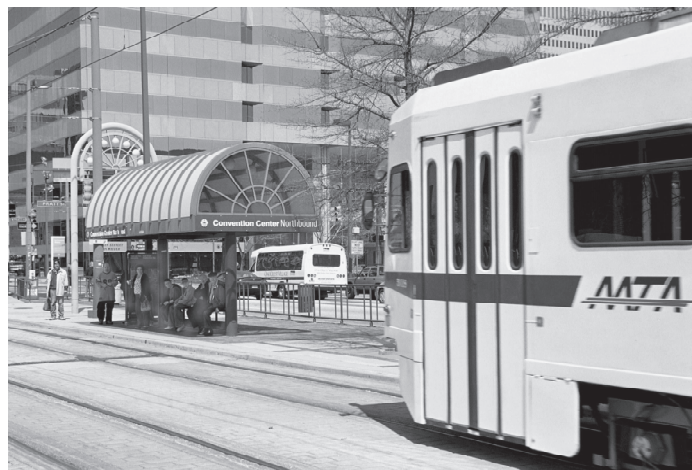
Downtown Baltimore light rail stations are surrounded by a variety of stores and offices.

Spring and Bethesda have experienced substantial rejuvenation. In Silver Spring, WMATA made the most of its parking lot and the space above the transit station to embark on a joint development that, when complete, will include office and retail space, housing, and a hotel. 89 The station eventually will be surrounded by other offices, restaurants, shops, and public space. These developments have produced economic benefits for