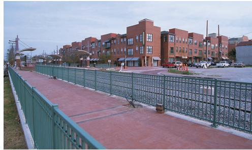
TOD projects offer multiple travel options, such as in this Plano, Texas, development with its broad sidewalk and street serving homes and stores located next to a rail station.

Second, and perhaps more significant, is the effect of commercial development around a rail stop, even if few or no homes are nearby. A substantial share of car trips are not just for commuting but for completing errands on the way to or from work. 12 Many people are reluctant to take transit to work because they lose the ability to make other stops. If more services are available at or near train stops, riding transit becomes more convenient. People may drive to the train station in the morning and complete errands on foot before driving home at the end of the day, reducing their total amount of driving. A survey of people’s travel choices in Portland, Oregon, demonstrates the impact of building homes, stores, and offices within walking distance of transit stations. People in neighborhoods with this mix of uses near transit drove 26 percent less compared to those near transit locations without this varied development. 13 (See Table 1.)