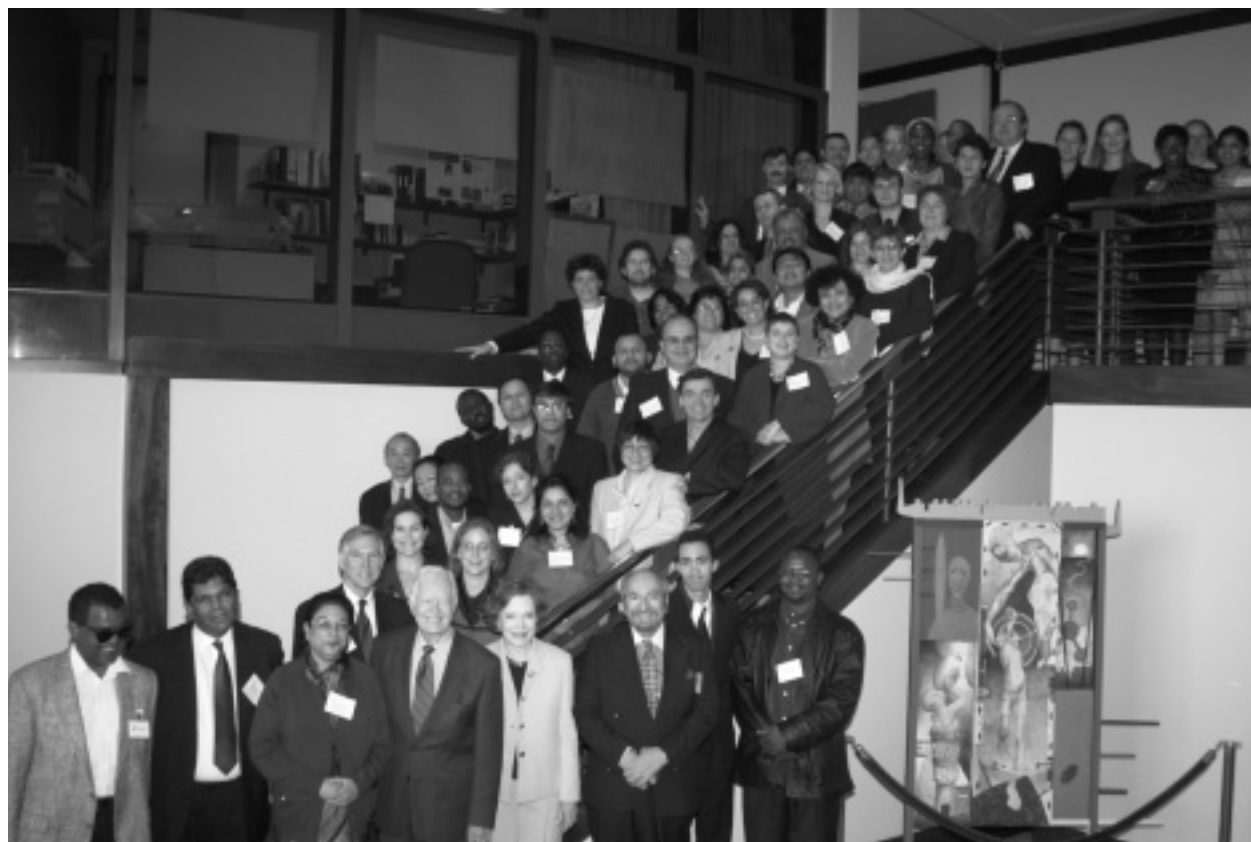
Human rights defenders from around the world joined President and Mrs. Carter and U.N. human rights leaders at The Carter Center, Nov. 11-12, 2003.