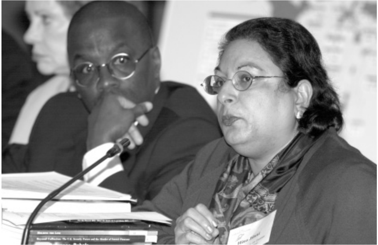
U.N. Special Representative on Human Rights Defenders Hina Jilani is an attorney and human rights defender from Pakistan.

foundation, which takes us out of the controversial issues of where are the basic principles going to come from. Religion? Ultrnationalist ideologies? That's why I think these are worth preserving. The work the human rights defenders do is exactly that: preserving principles. We don't necessarily just defend people. We defend people in the act of defending principles. I think it's very important to see where the strengths are going to come from so that we can sustain the work that we do in a manner in which we are able, not only to preserve what we have but to go forward and to strengthen the very values for which we have fought for a long time.