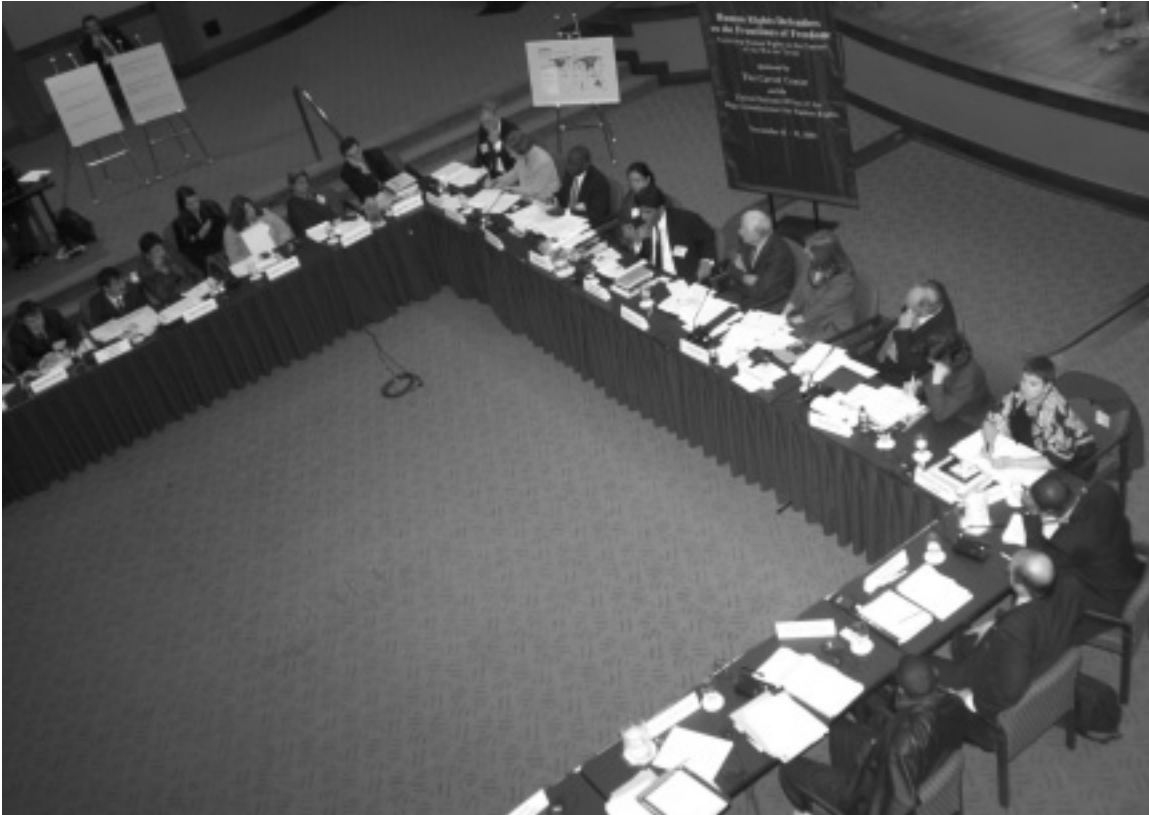
The conference allowed for two full days of intense discussion among defenders from around the world about balancing the need for global security with protection for fundamental rights.

increase in the resources allocated to the United Nations' human rights system.