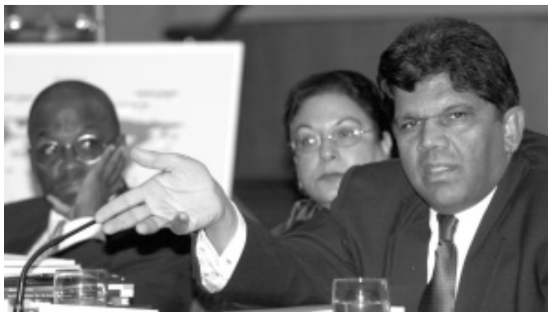
U.N. Acting High Commissioner for Human Rights Bertrand Ramcharan stepped into the breach after the death of Sergio Vieira de Mello in Baghdad.

Thank you very much, President Carter, and may I say to you and Mrs. Carter what a great honor it is to be here at The Carter Center and to join with you on this occasion to take stock of the state of human rights in the world in contemporary circumstances and perhaps to think about ways ahead for the defense of human rights and to support the human rights defenders who are gathered around this table and those who are not.