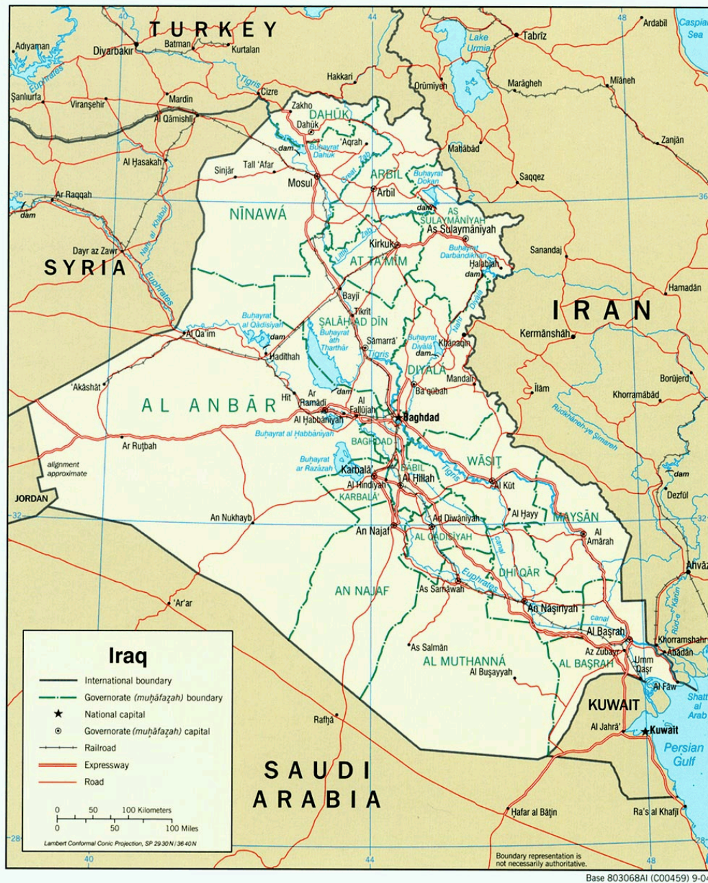
Figure I. Map of Iraq