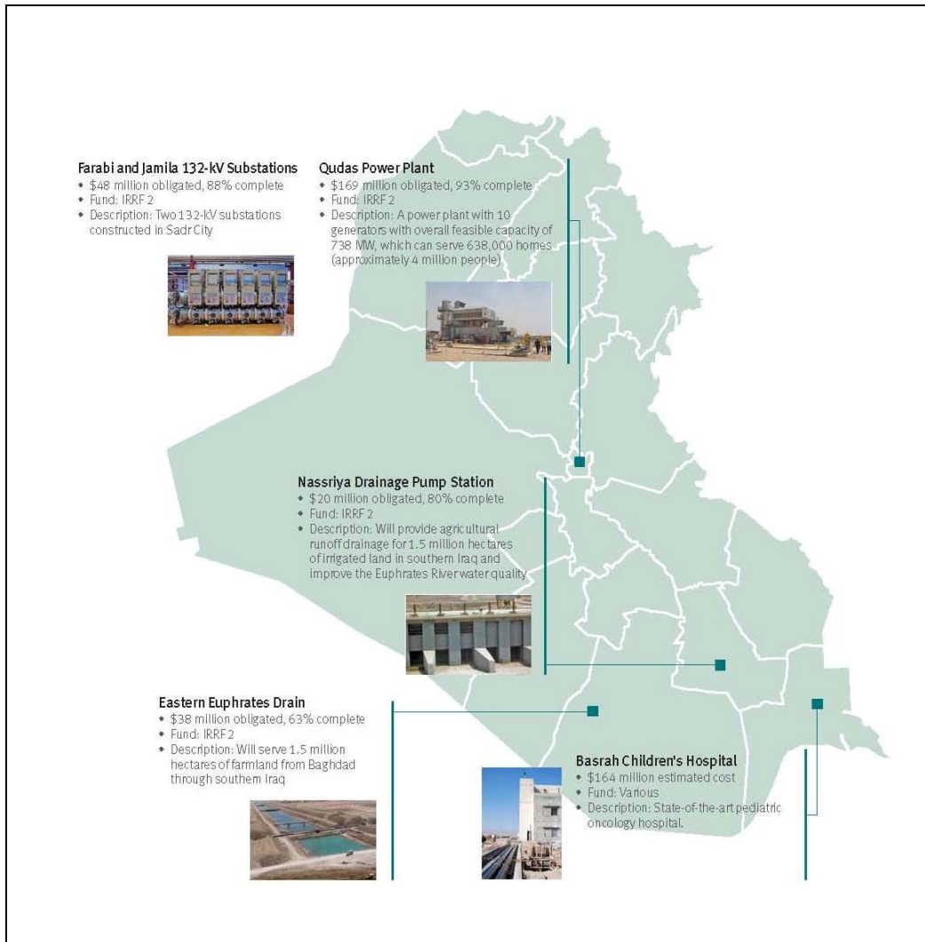
Figure 4. Infrastructure: Major Ongoing Gulf Region Division [GRD] Projects

Source: Special Inspector General for Iraq Reconstruction (SIGIR), at http://www.sigir.mil/reports/quarterlyreports/Jan09/pdf/Report_-_January_2009_LoRes.pdf . GRD, response to SIGIR data call, 1/5/2009; GRD, "Basrah Children's Hospital: Overview and Status Update," 1/5/2009. Photos: GRD, Essays Forward , Vol 4, Issue 2; DoD, http://www.defenselink.mil/news/briefingslide.aspx?briefingslife=317 , 1/13/2009; http://www.symbion-power.com/experience/sub_farabi.html , 1/13/2009; GRD, Essays Forward , Vol 5, Issue 2.