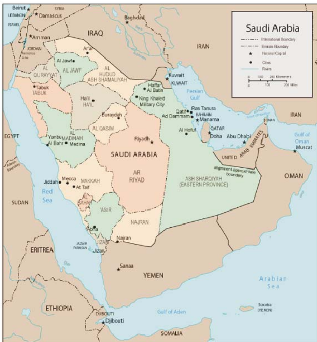
Figure 1. Map of Saudi Arabia

Source: Map Resources Adapted by CRS. (March 2008)