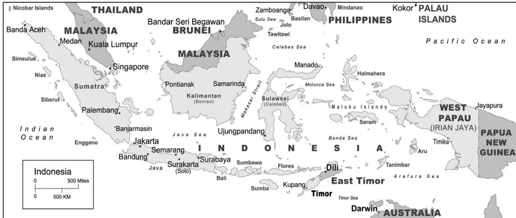
Figure 2. Indonesia

Source: Map Resources. Adapted by CRS. (K.Yancey 4/12/04)