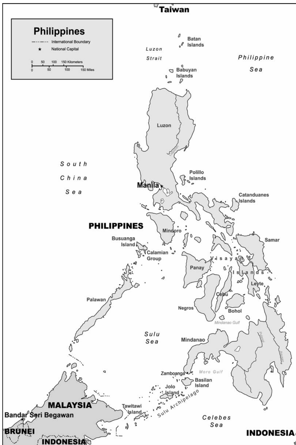
Figure 4. The Philippines