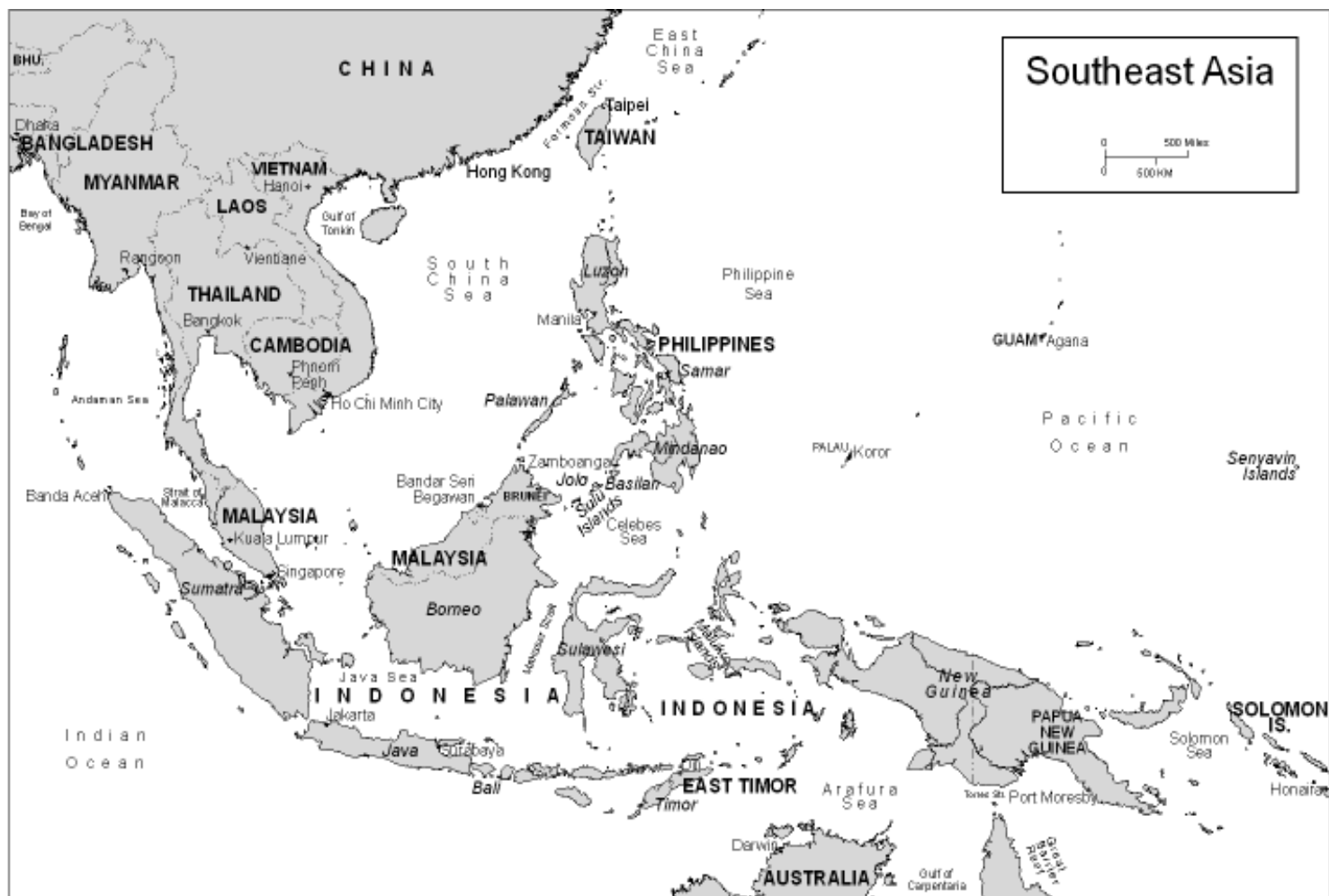
Figure I. Southeast Asia