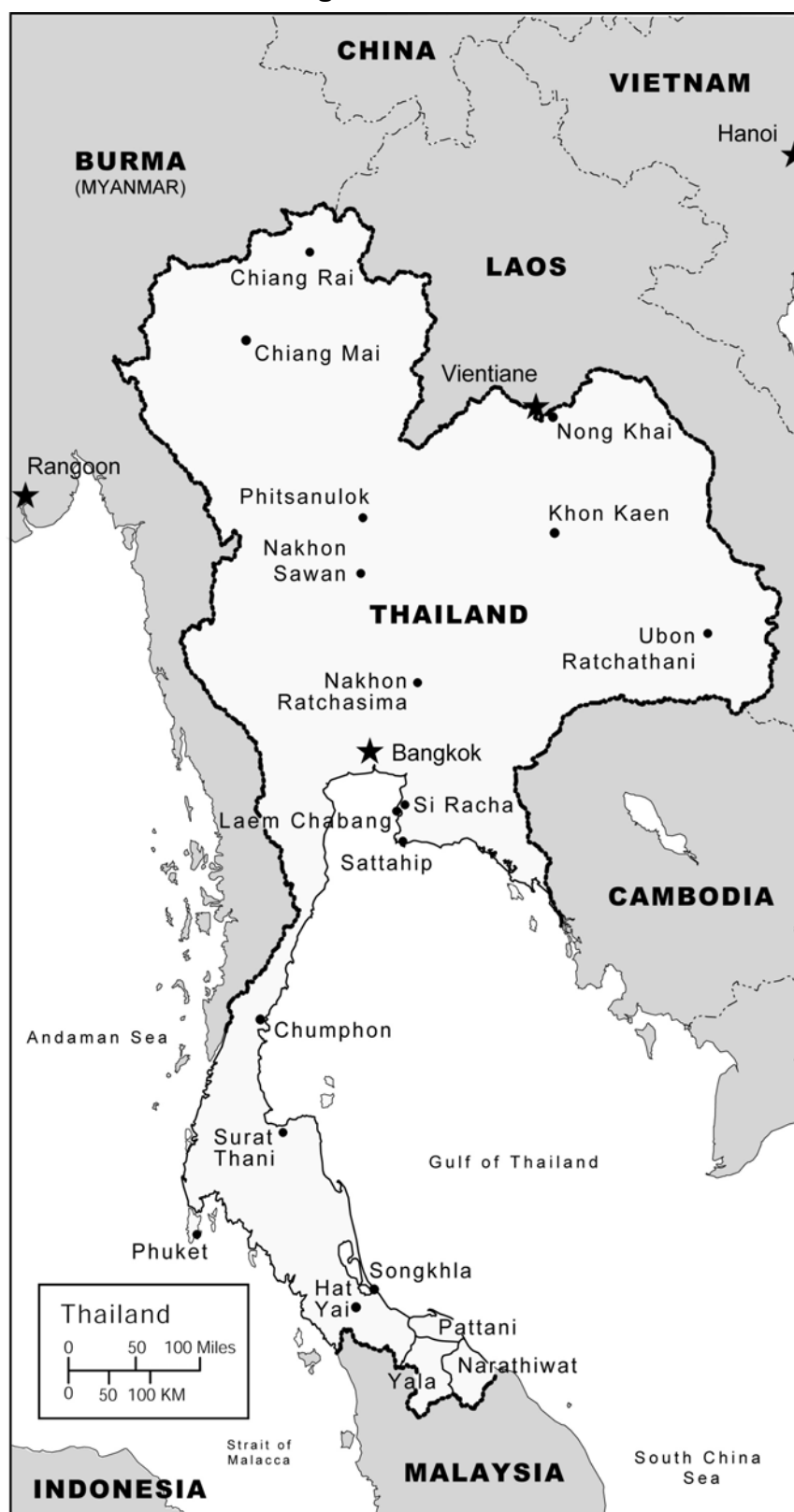
Figure 5. Thailand