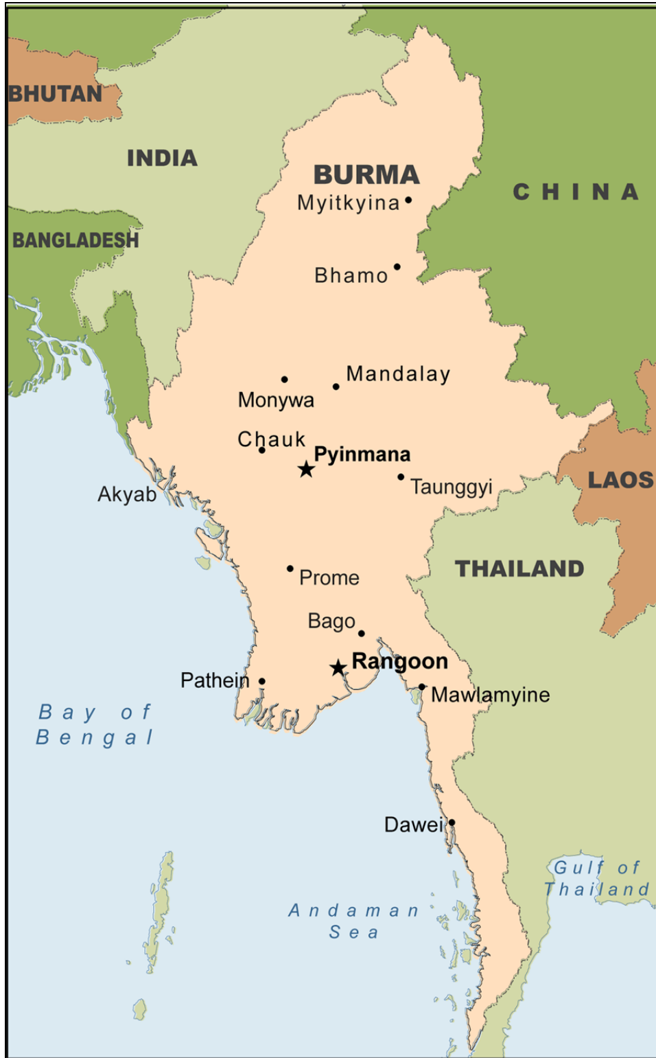
Figure 2. Map of Burma