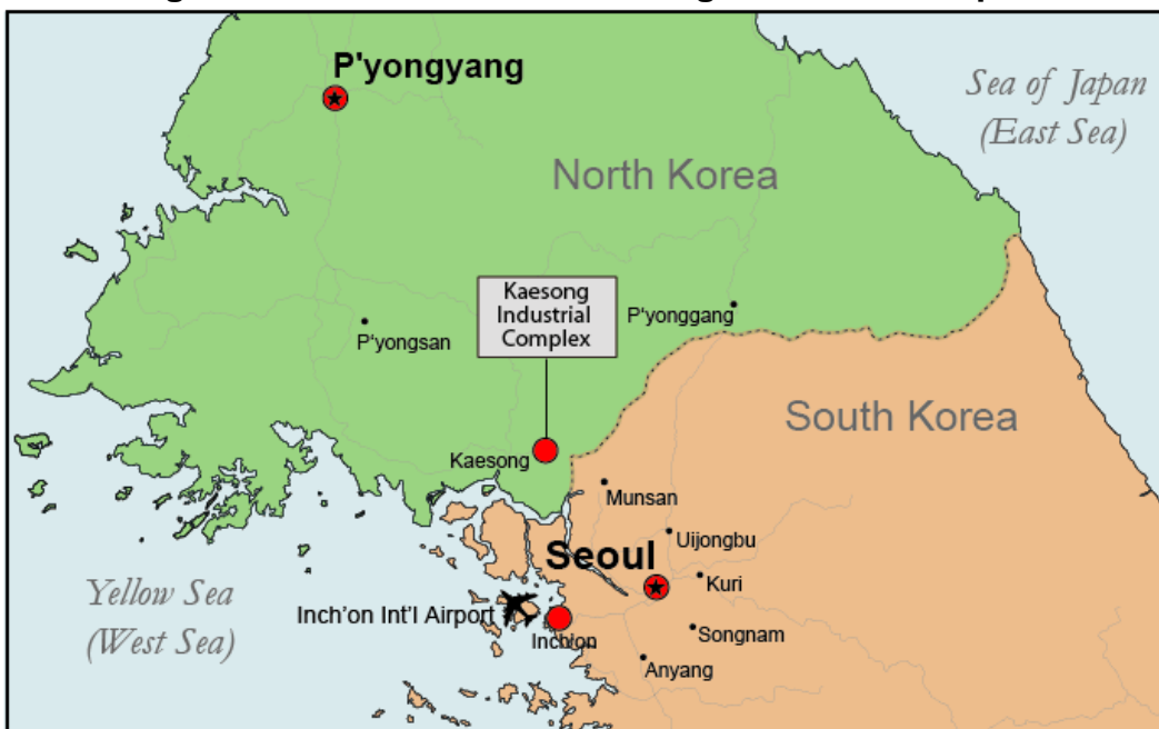
Figure 1. Location of the Kaesong Industrial Complex