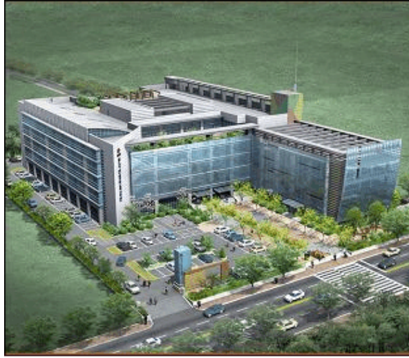
Figure 2. Leased Space Factory Building to be Constructed in the Kaesong Industrial Complex