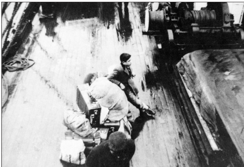
Egyptian-Jewish emigrants, before embarking on the ship to Marseilles, France. Port of Alexandria, Egypt, 1956.