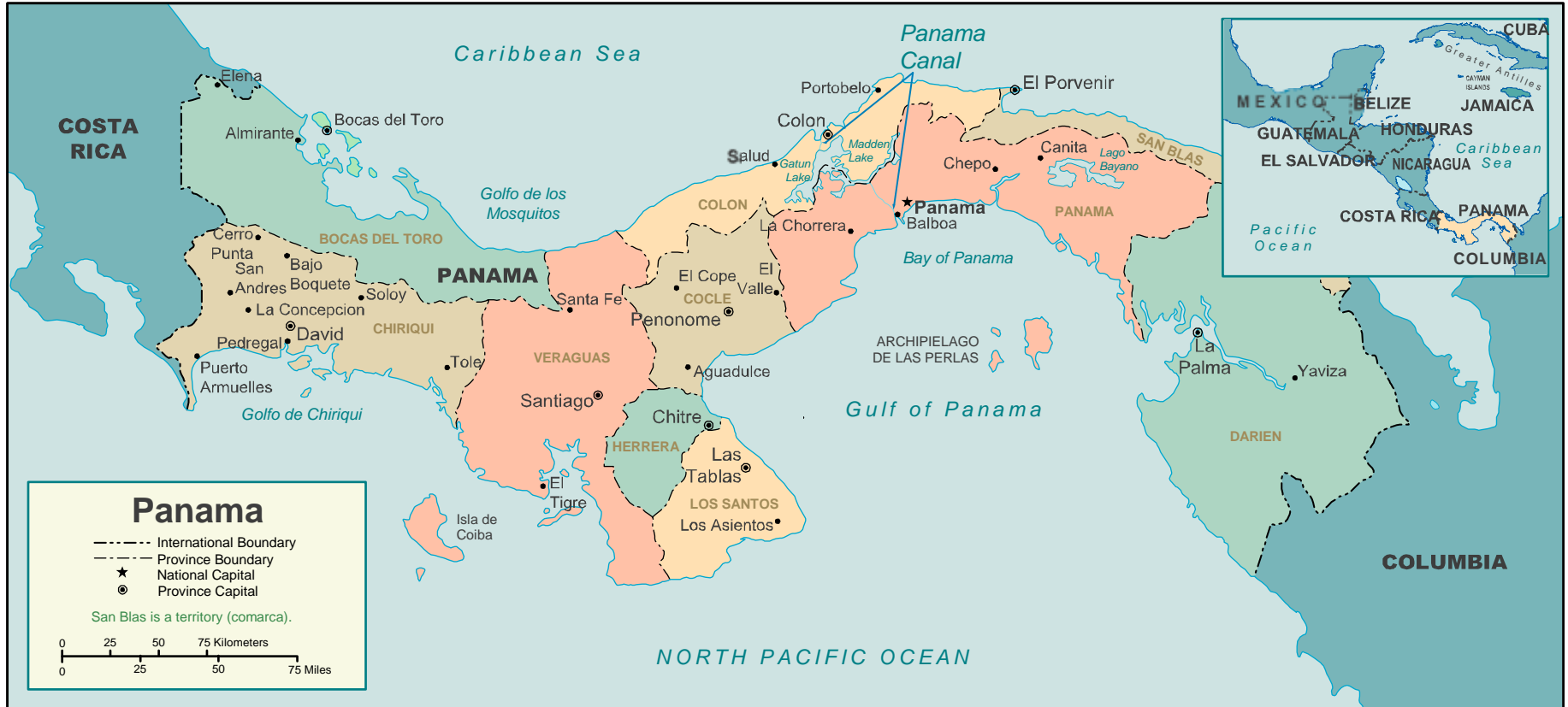
Figure 1. Map of Panama