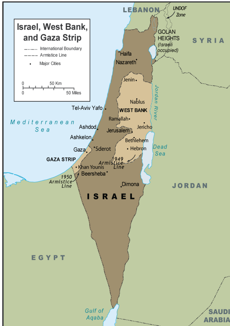
Figure 1. Map of Israel, the West Bank, and the Gaza Strip