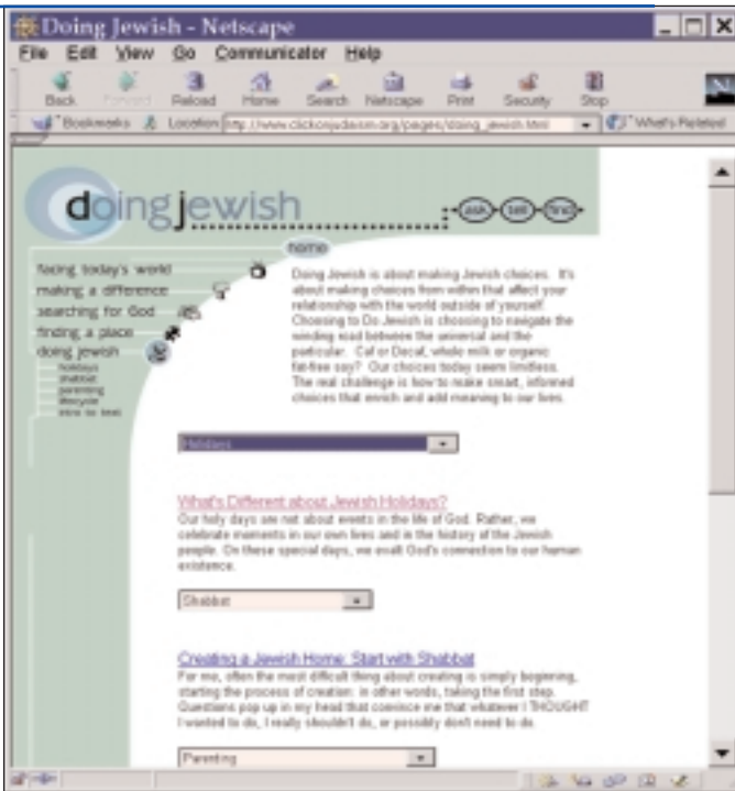
Articles on the 'Doing Jewish' page are about "making choices from within that affect your relationship with the world outside of yourself."