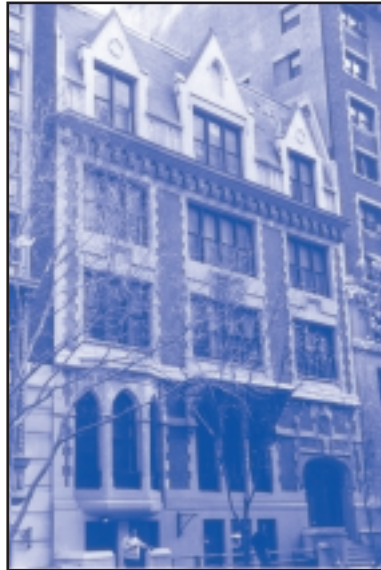
The Makor building, on West 67th Street in New York City.

Consequently, in planning Makor, a place for New Yorkers in their 20s and 30s , which will open this Spring at 35 West 67th street in