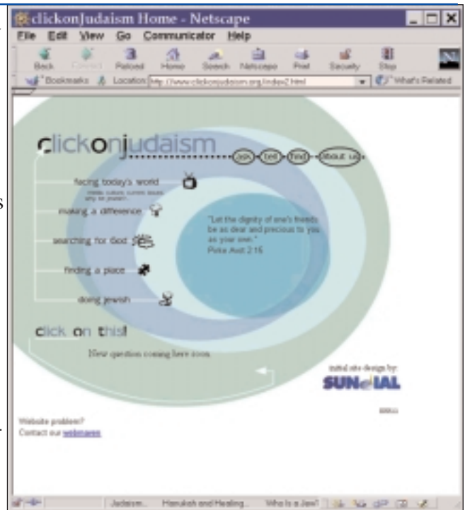
The home page at www.clickonJudaism.org.

meant to stimulate the asking of questions. It aims to be a place where seekers can find direction, journeys can begin, connections can be made, and struggles can be informed. Through its variety of essays and features, the website is designed to be a springboard for the creation of Jewish meaning. And the Internet is the perfect medium for this endeavor. For those who are