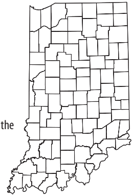
State of Indiana

The Center for Urban Policy and the Environment is part of the Indiana University Public Policy Institute and the School of Public and Environmental Affairs at Indiana University-Purdue University Indianapolis. An electronic copy of this document and other information about other community issues can be accessed via the Center Web site ( www.urbancenter.iupui.edu ). For more information, visit the Web site or contact the Center at 317-261-3000.