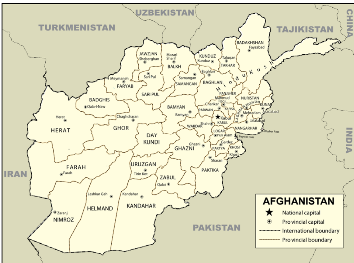
Figure A-1. Map of Afghanistan