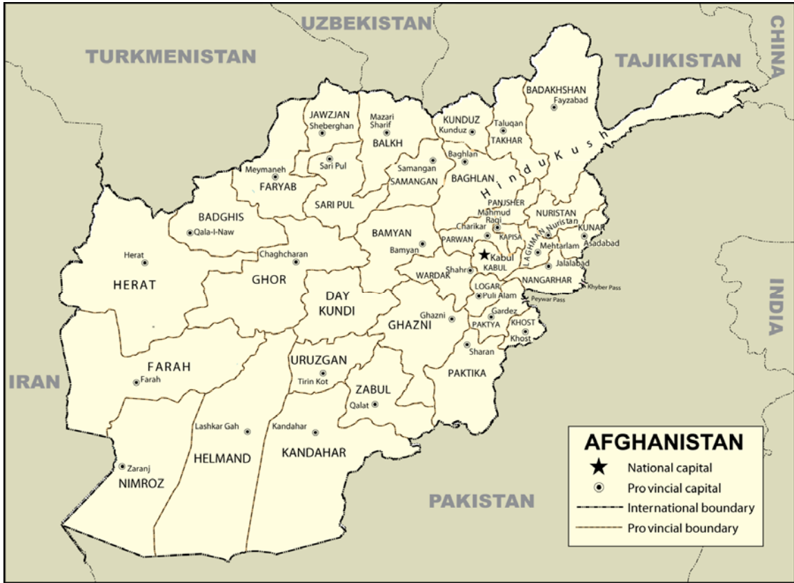
Figure A-I. Map of Afghanistan